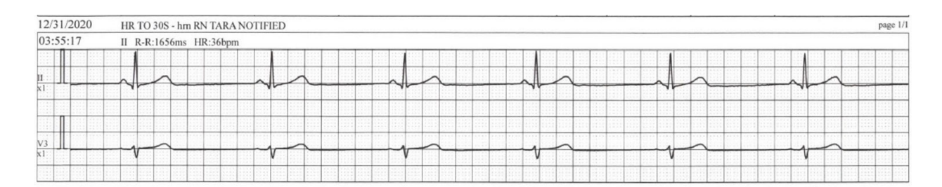
Figure 3. Sinus bradycardia on 12/31/2020 during sepsis (HR 36)