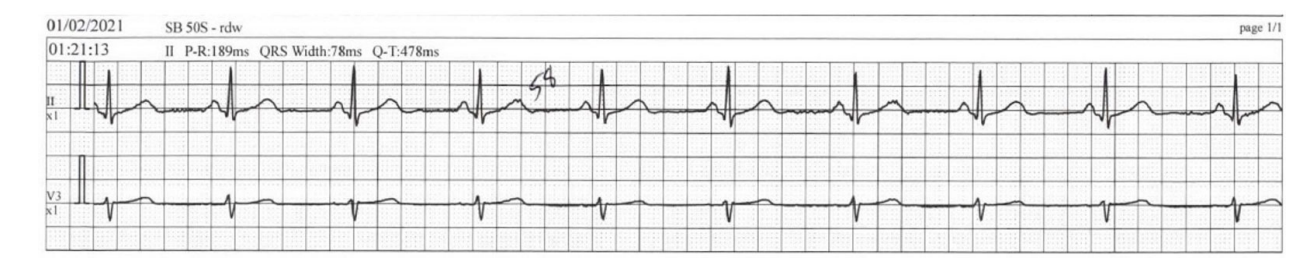
Figure 4. Recovery of HR (HR 78)

Cardiac telemetry monitor at home for seven days showed rare premature ventricular contractions (PVCs) and premature atrial contractions (PACs). Nuclear stress test revealed no evidence of ischemia.